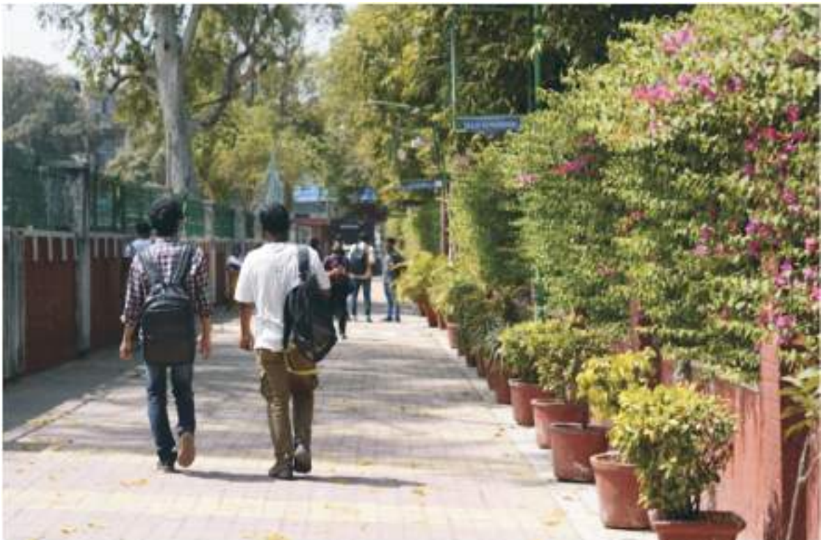
University of Delhi

Admission to School of Open Learning (SOL) and NCWEB will be based on Class XII marks. Candidates must register themselves on www.admission.uod.ac.in